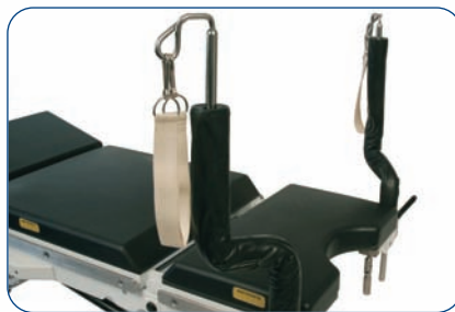
The Opmaster 53 I with gynae poles.