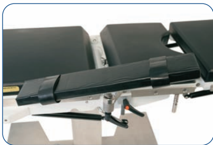
The Opmaster 53 I with a multi-joint arm positioning table.